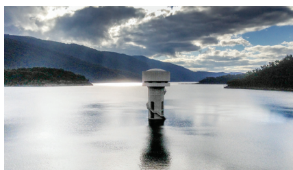
WATER AND FOOD SUPPLIES