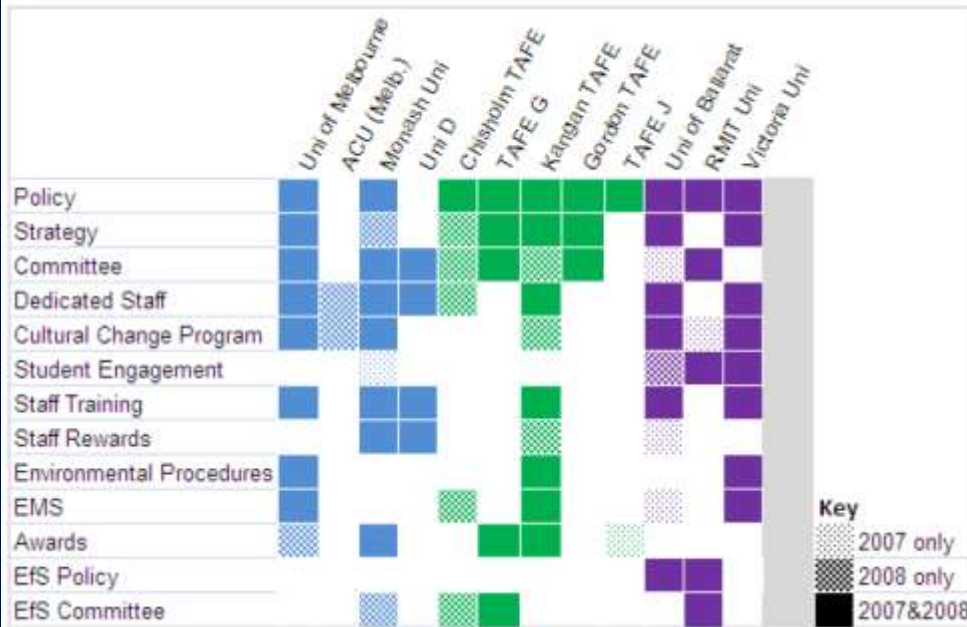
Figure 21: Institutional commitment in 2008 to increase sustainable purchasing