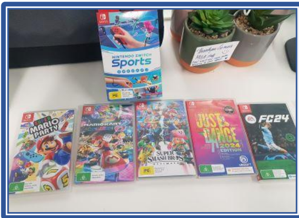
Games for Student Lounges