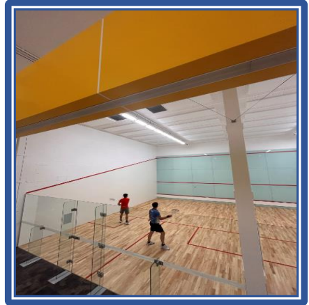
Squash Court Upgrade