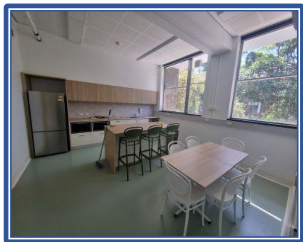
Chemistry Postgraduate Society Lounge