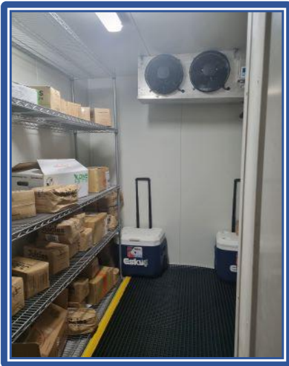
Event Freezer Refurbishment