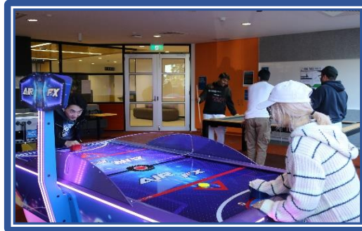
New Student Lounge, Event Space and Games Room - Caulfield