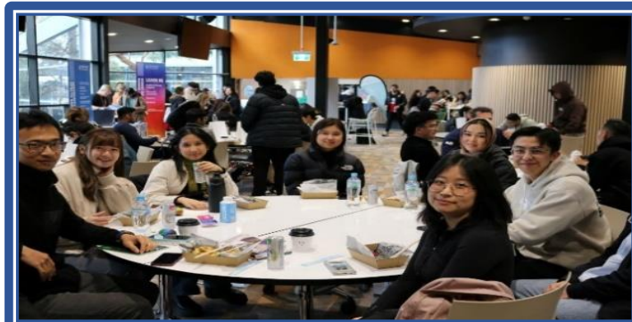
New Lounge and Student Event Space – Peninsula Campus