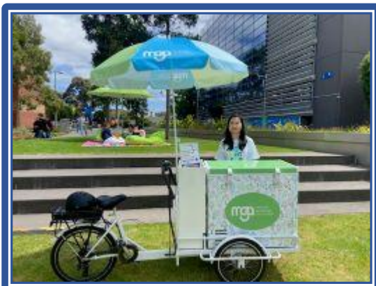
MGA Ice Cream Cart