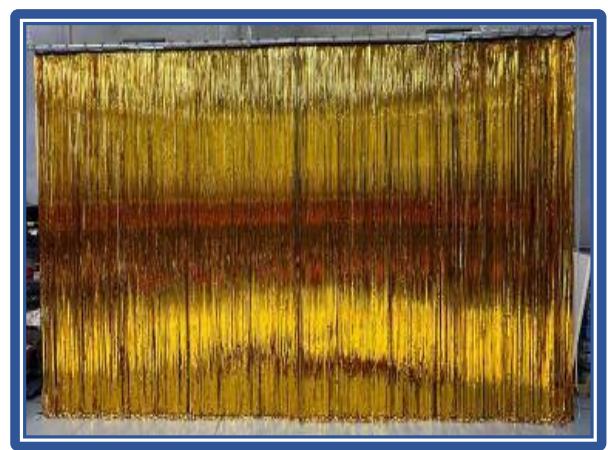
Curtain for Student Theatre