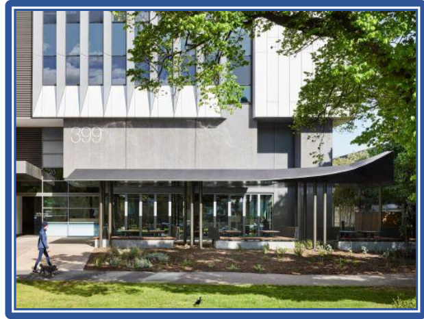
Parkville Outdoor Space