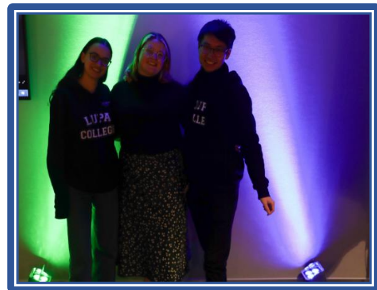
Event Lighting Caulfield