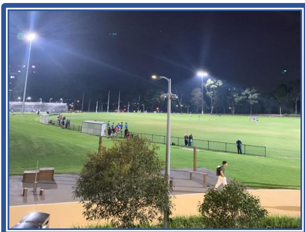
Frearson Oval Lighting