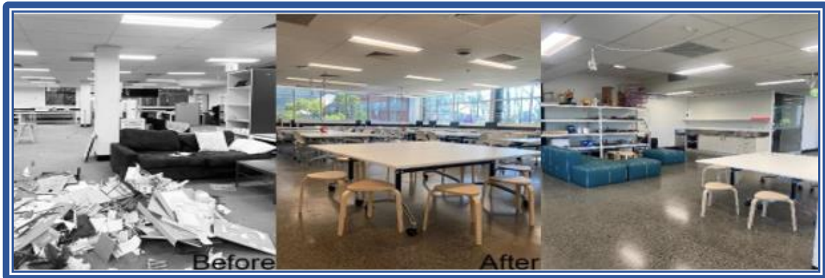
MADA Masters Lounge Refurbishment - Caulfield

The nature of the projects funded from the 20% pool can be seen from the photos of completed projects kept on the University SSAF webpage photo gallery. These projects range from renovating various student club and cohort common rooms to upgrading the studio facilities of our student run Radio station, Radio Monash. They include improvements to our student theatre space and the sporting spaces across our campuses. In 2023, 92 projects with budgets ranging from $500 to $300,000 were supported from this pool of funds. A sample of these projects are shown below: