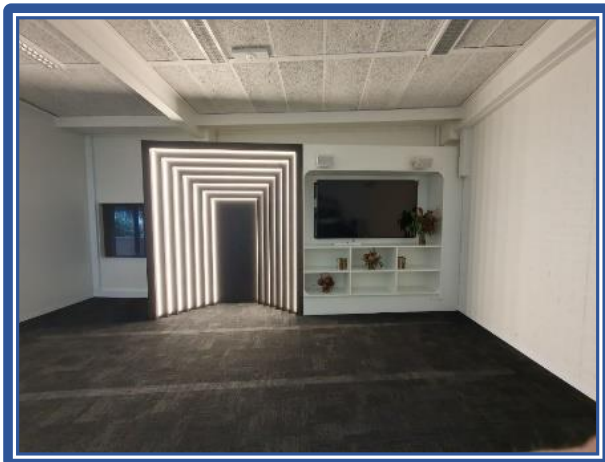
Male and Female Prayer Rooms Clayton