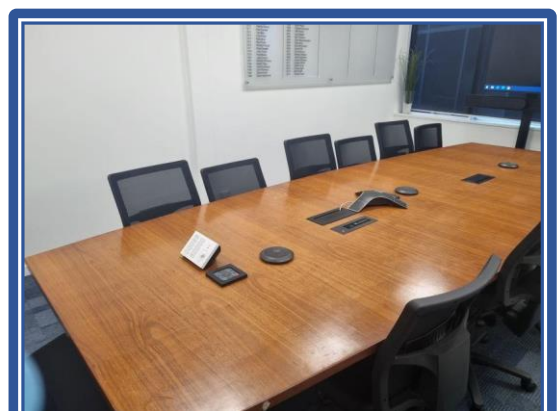
MSA Meeting Room Furniture