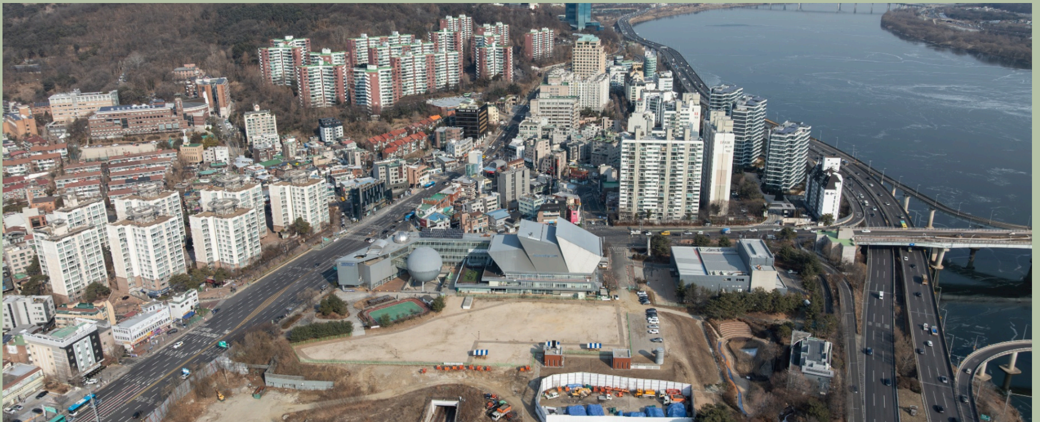
Aerial photograph provided by Metropolitan Seoul City