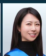
Judge Wen-Ju Wu Taiwan High Court