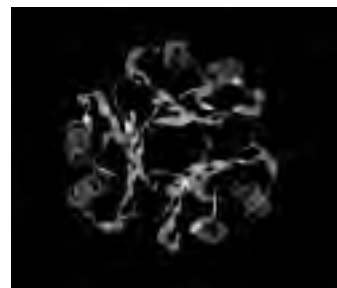
Small molecule cytokine antagonists.

Monash researchers are working on a compound that blocks the negative effects of a protein that is fundamental to the development of arthritis and other inflammatory diseases.