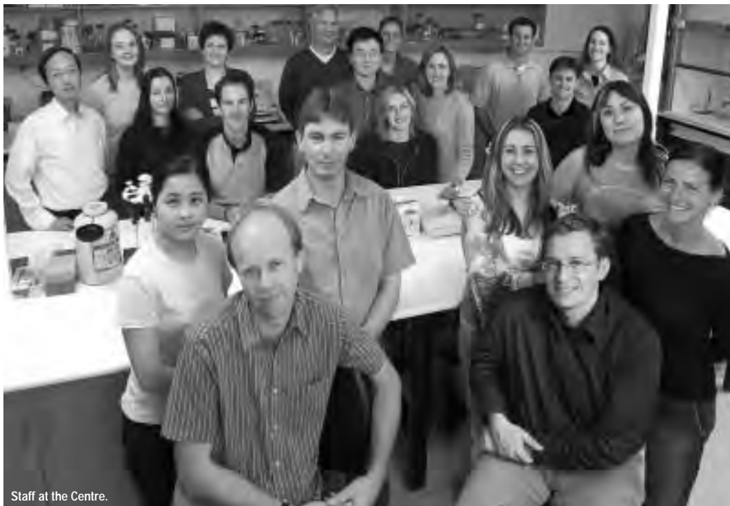
Staff at the Centre.