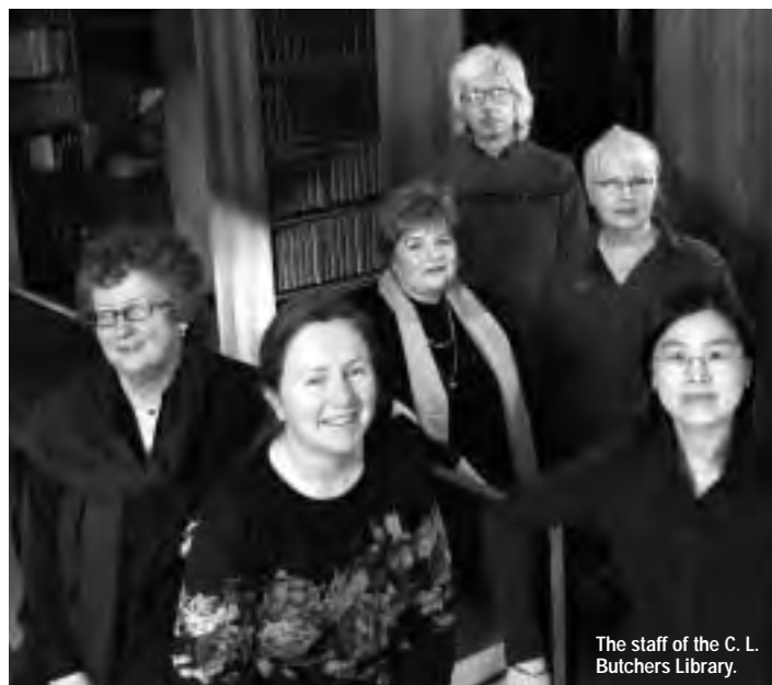
The staff of the C. L. Butchers Library.