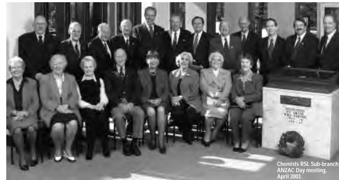
Chemists RSL Sub-branch ANZAC Day meeting, April 2003.