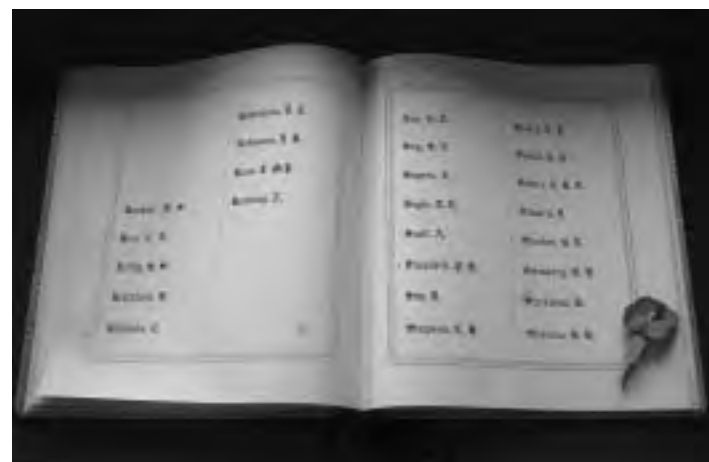
The Book of Remembrance, and the Book of Remembrance display case (above) in front of the picture of Sir John Monash in the Sissons Building foyer.