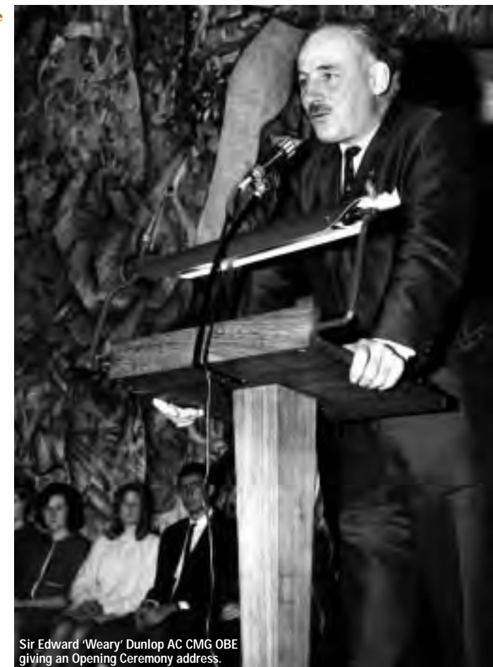
Sir Edward 'Weary' Dunlop AC CMG OBE giving an Opening Ceremony address.