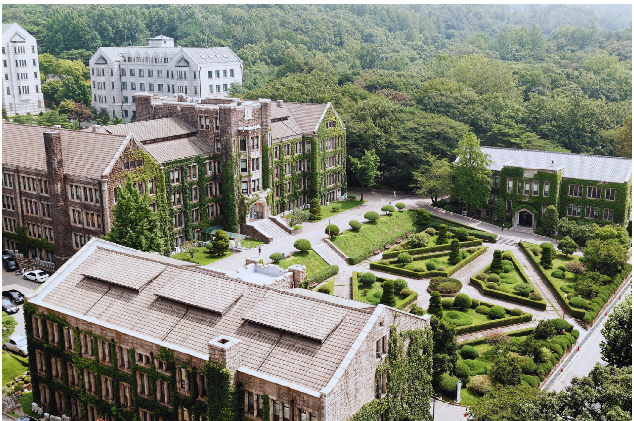
Photo depicting Underwood Hall, Yonsei University Sinchon Campus.

Note that these dates do not accurately align with the Monash Semester dates, and therefore I missed 2 weeks of classes at Monash.