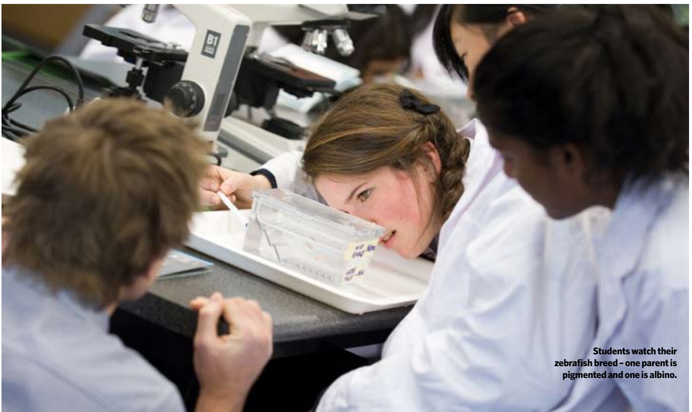
Students watch their zebrafish breed - one parent is pigmented and one is albino.