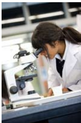
Above: a student gets a closer look. The embryo will either be pigmented or albino, depending on its genes.