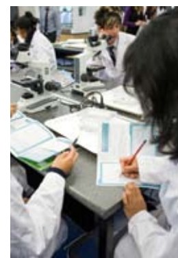
Above: students record their zebrafish observations.