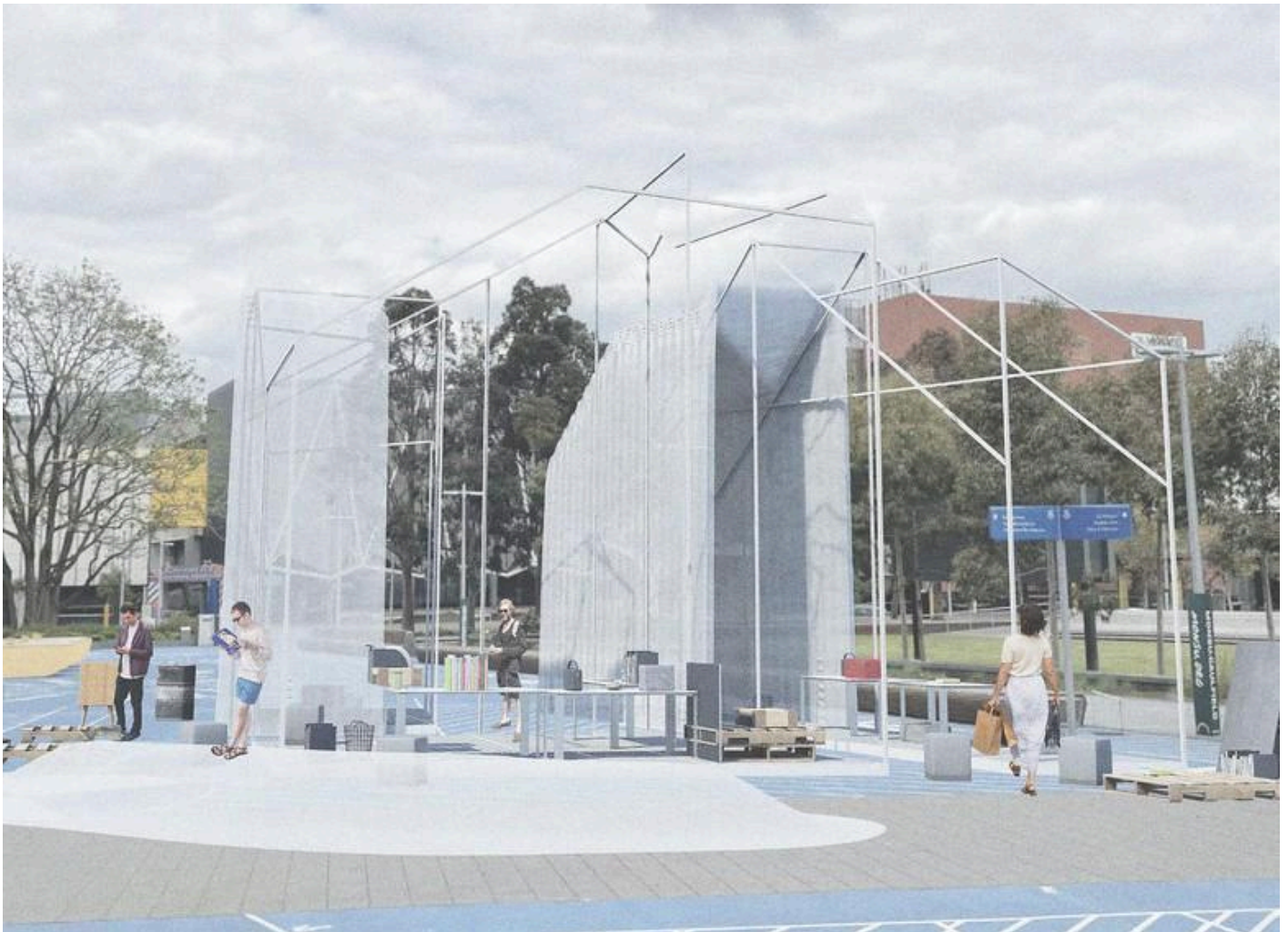
Living on Campus (2021) Andy Nguy

Studies Units typically run for 3 hours per week, over 12 weeks.