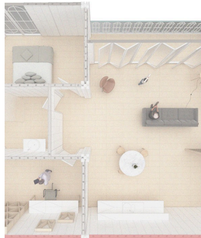
Urbanism of Walls (2021) Anne Barlow

Masters Studios typically run on a single day for 6 hours per week for 13 teaching weeks.