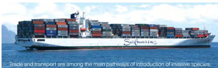
Trade and transport are among the main pathways of introduction of invasive species.