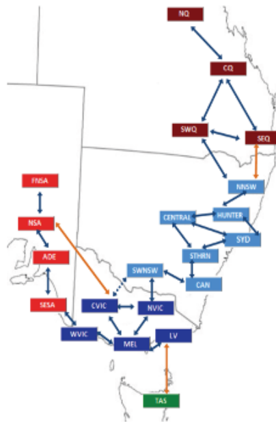
Figure 1: Map of the 21-node NEM transmission network simulated in the MUREIL scenarios. Orange lines represent HVDC links, while blue represents conventional HVAC. Dashed lines are under planning/construction.