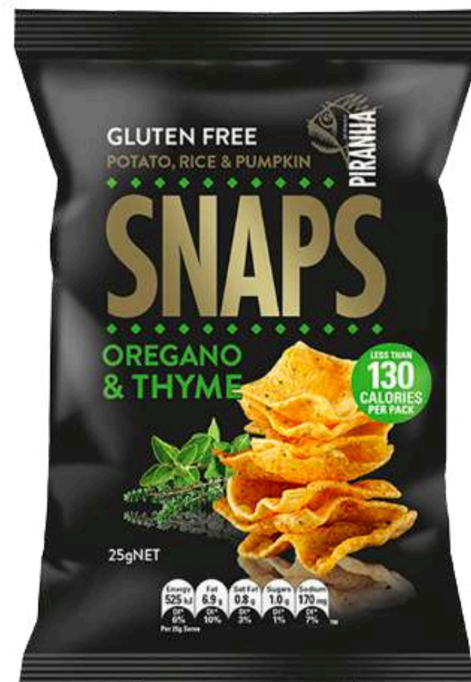
SNAPS OREGANO & THYME 25g

Gluten free chips made with potato, rice and pumpkin. Only 130 calories