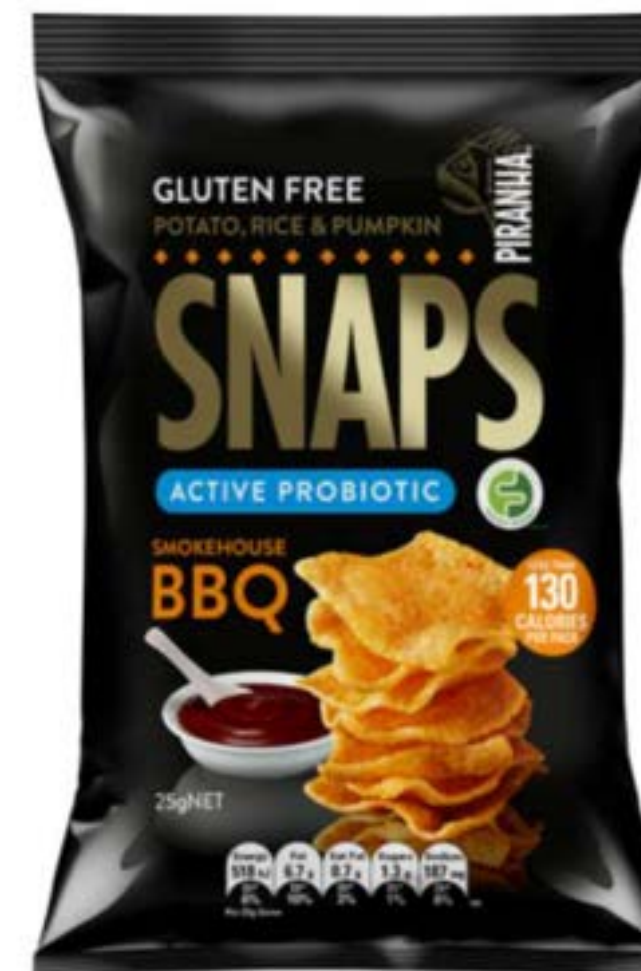
SNAPS SMOKEHOUSE BBQ 25g

Gluten free chips made with potato, rice and pumpkin. Only 130 calories