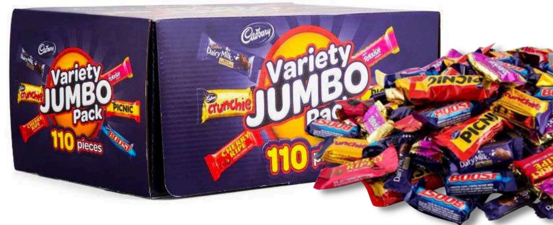
CADBURY VARIETY JUMBO PACK