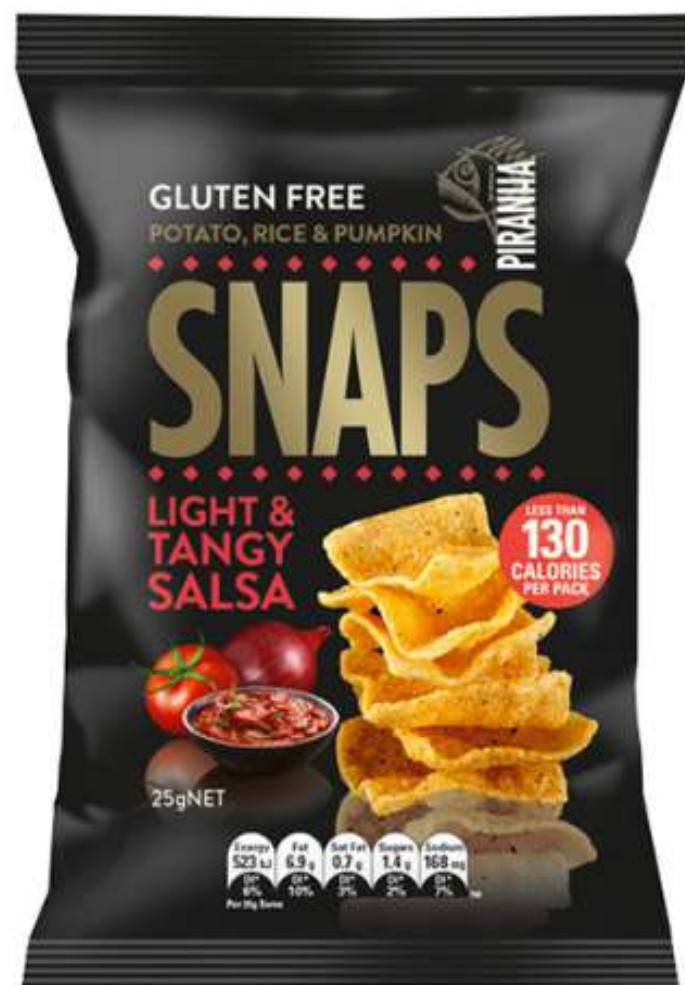
SNAPS LIGHT & TANGY SALSA 25g

Gluten free chips made with potato, rice and pumpkin. Only 130 calories