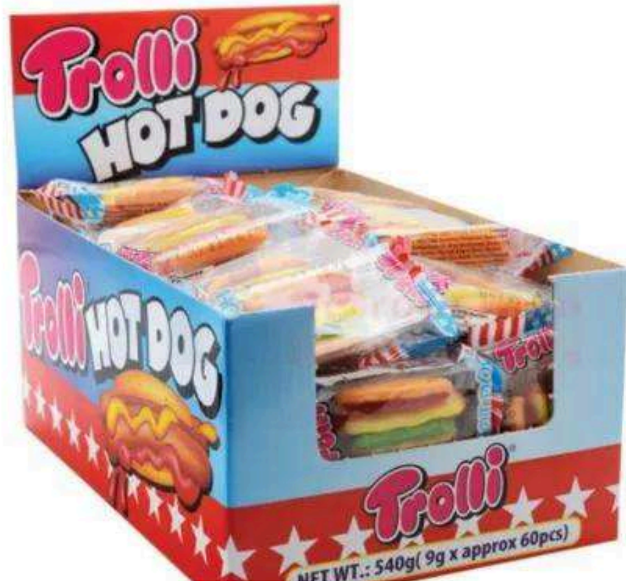
TROLLI HOTDOG, 10G - 60 PACK