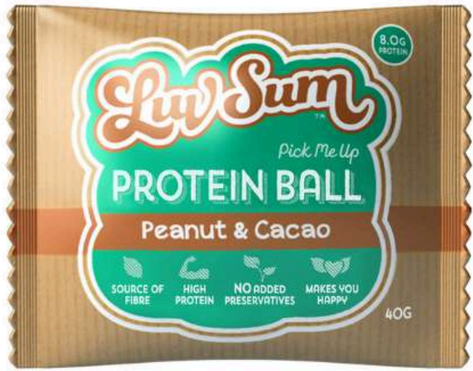
PROTEIN BALL PEANUT CACAO 40g

Protein ball with peanut base and the rich flavour of cacao.