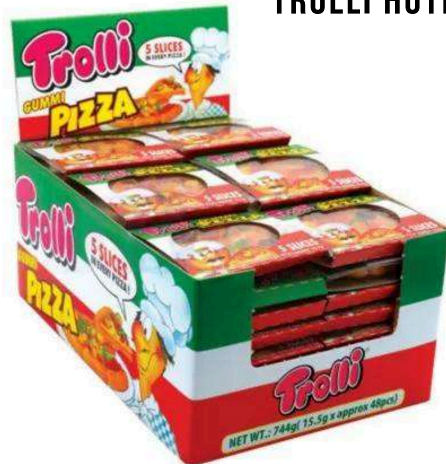
TROLLI PIZZA, 15.5G - 48 PACK