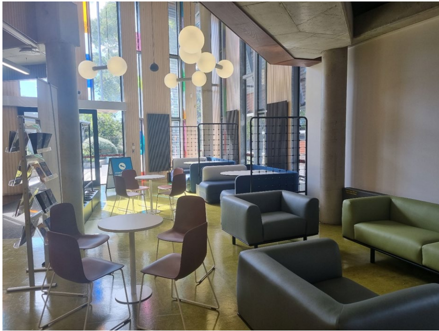
Image: Installation of new booths, lounge seating and additional tables and chairs, providing students a dedicated space to socialise before or after using Monash Sport facilities (Peninsula campus)