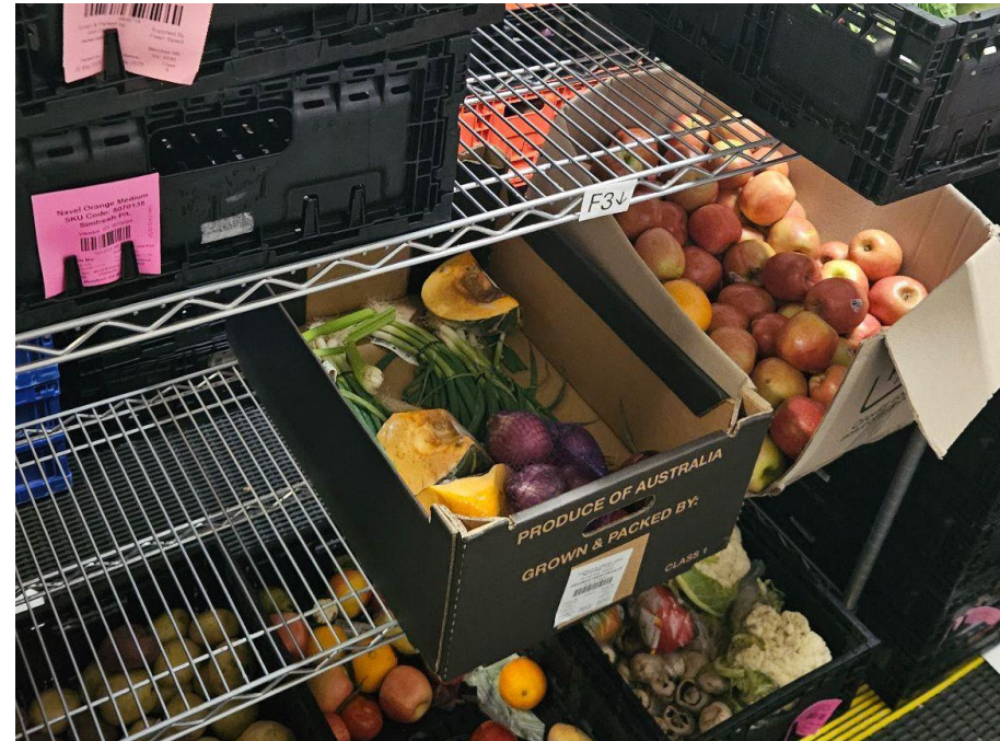
Image: Monash Student Association (MSA) coolroom shelving installation (Clayton campus) to ensure there is sufficient shelving to store items safely to support the MSA's Food Security Program.