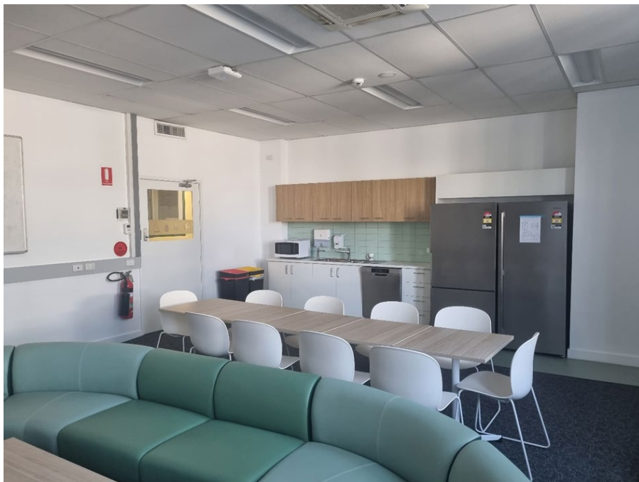
Image: The Chemistry Honours and Miscellaneous Postgraduate Society (CHAMPS) student lounge (Clayton campus) was relocated into a new, larger space with improved facilities, including new furniture and a kitchenette.