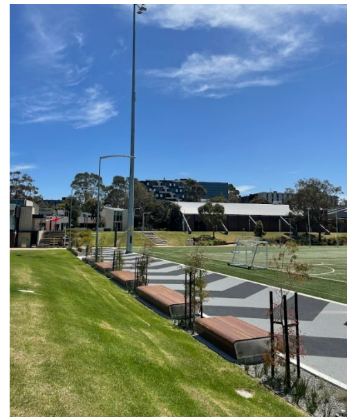
Image: Clayton Sports Walk connection landscaping, providing improved safety, security and amenity to the Monash Sport Precinct.