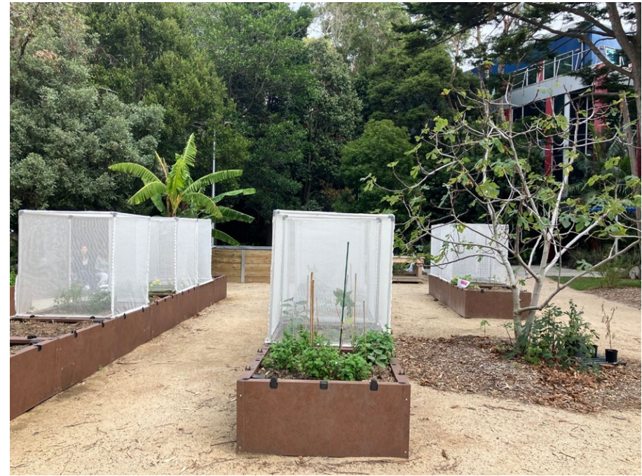
Image: Monash Student Association (MSA) permaculture garden redesign (Clayton campus) — now with raised beds, wider paths, fruit trees, netting, and secure storage, the space is inclusive, functional, and thriving for all students.