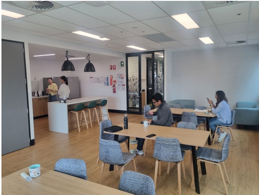
Image: Business School research student lounge renovation (Caulfield campus)

In 2024, 135 projects with budgets ranging from $300 to $300,000 were supported by the competitive 20% SSAF pool. To date, over 100 have been completed. Many of these are highlighted on the University's SSAF webpage photo gallery . These initiatives encompass a wide range of improvements, including renovations of student club and cohort common rooms, enhanced food storage and food security measures, upgraded student games and recreational spaces, expanded student wellness resources, and sustainable campus infrastructure. A sample of these projects across all of Monash's Australian campuses is provided below.