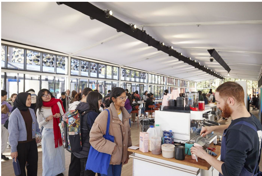
Image: The “Monash Recharge” event, providing students with opportunities to connect with support services, take a break from their studies and learn how to prioritise their wellbeing.