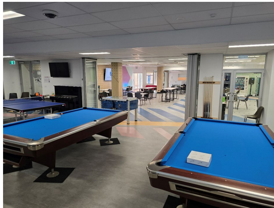
Image: Refurbishment of the Monash Parkville Student Union (MPSU) games room pool tables (Parkville campus) and addition of new games, including a portable table tennis setup.