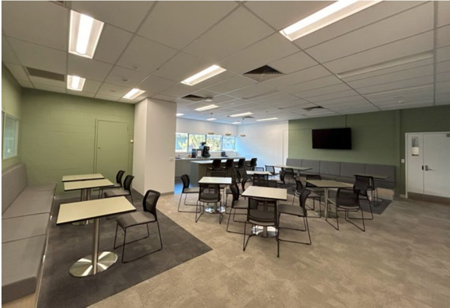
Image: Renovated Engineering student common room (Clayton campus), creating a multi-use space for students use and functions. Upgrades included a kitchenette with appliances and large screen television.