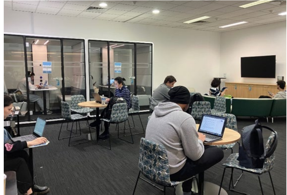
Image: Monash Graduate Association (MGA) graduate lounge refurbishment (Clayton campus) saw the reconfiguration of the lounge space and meeting rooms to accommodate more students, and provide better facilities, including quiet booths and audio-visual equipment.