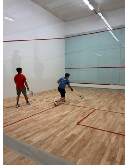
Image: Refurbishment of the Clayton squash precinct, which provides improved playing and viewing spaces.