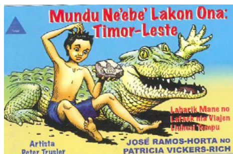
Figure 2. Book in Timorese Tetun on the geology of Timor, for primary.