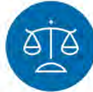
Ethical and empathetic reasoning