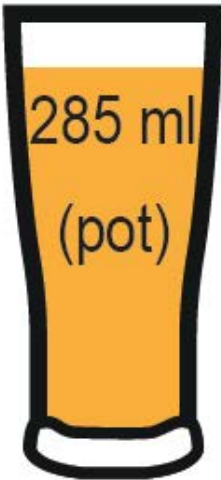
Full strength beer