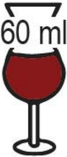
Port or fortified wine