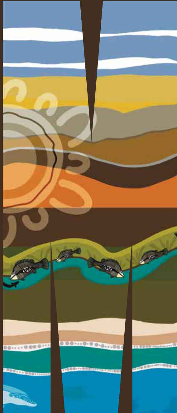
'KOOTIE WURRIN (ONE DAY)', ARTWORK BY TRACY WISE

Monash Rural Health monash.edu/rural-health rural.health@monash.edu