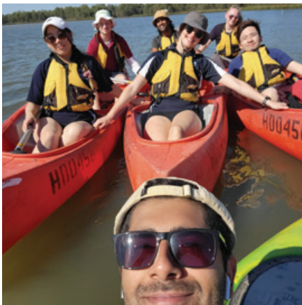
End-to-End Rural Cohort students explore the Loddon Mallee

The End-to-End Rural Cohort is funded by the Australian Government under the Murray-Darling Medical Schools Network.