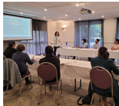
Clinical Teaching and Education sessions in action in Bendigo and Gippsland

Following the successful completion of stage one of the course, twenty doctors were supported by the Monash Regional Training Hubs to complete stage two - a full-day course delivered by the Monash Centre for Scholarship in Health Education with a focus on quality supervision. Doctors who completed this training are prioritised for education positions with Monash Rural Health and regional health services.