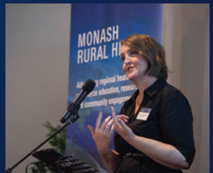
Monash graduates, students, staff and supporters celebrating

During the year, we celebrated ten years of Monash University's graduate entry medicine program in Gippsland. Alumni, current students and staff, health service representatives and community stakeholders celebrated in Traralgon. Many graduates from the program are currently living and practising in Gippsland, highlighting the long-term benefits of rurally-based training on the health workforce.