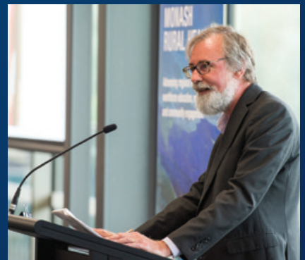
Monash Rural Health staff at the School's 30th-anniversary lunch

This milestone provided the opportunity to celebrate our achievements with our staff and reflect on the vision for our School for the next four years, with the development of a new strategic plan to be released in 2023.