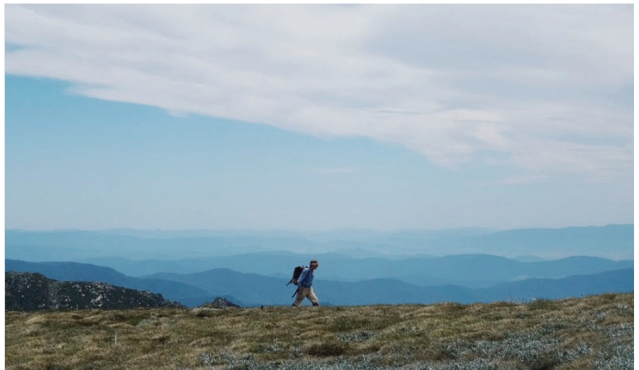
2022 WILDFIRE Photography Competition winner