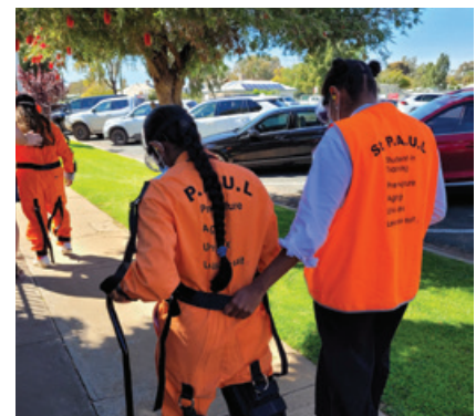
Monash nursing and midwifery students participating in learning activities while on placement