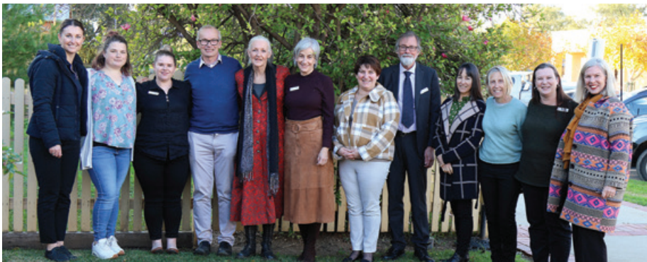
Members from the Sunraysia Collaboration at the launch event in Wentworth

Through the work of the Sunraysia Collaboration, nursing and allied health student placement activity in the region increased from 150 weeks in 2018 to over 400 weeks in 2022. This growth included an increased breadth of disciplines, with new placements enabling speech pathology and nursing students to spend extended time in the region, and service-learning placements established in primary schools. There were also increased student placements in smaller towns across the Sunraysia area, such as Robinvale and Balranald.