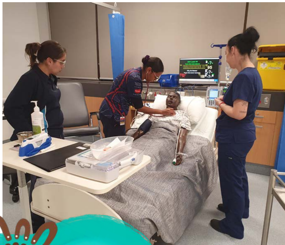
Image: Nursing students practicing clinical skills