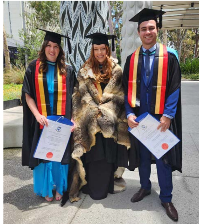
Image: Indigenous students celebrate finishing their degrees at graduation.

Image: Gukwonderuk by artist Marykia Males Yorta Yorta. Gukwonderuk (Wotjobaluk) is a highly respected cure-all medicine plant that grows across Southeast Australia.