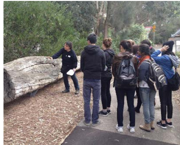
Image: Mullum Mullum Scarred Tree in the Monash Indigenous garden.

We would like to acknowledge the Traditional Owners of the lands from which Monash University and Gukwonderuk work on. We pay our respect to Elders past and present.