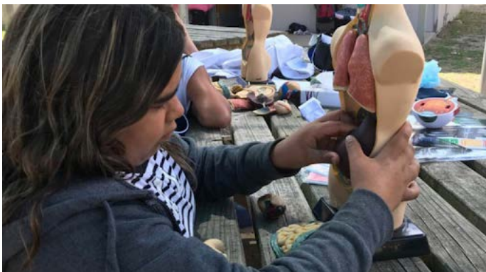
Image: learning about how the body works