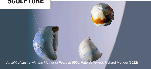
A night of Lustre with the Mother of Pearl, all 690c. Pate de Verred, Richard Monger (2022)