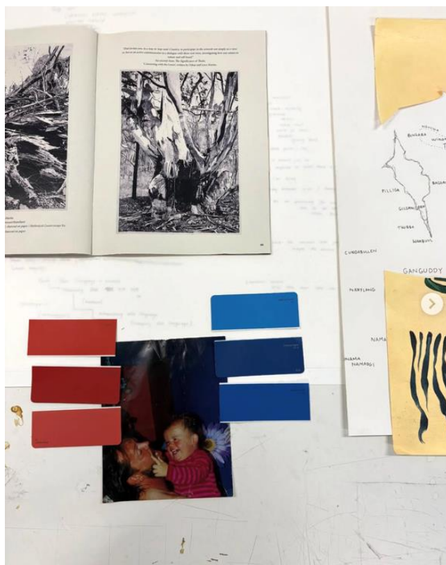
Documentation images: crit sessions in semester two. Preliminary plans of an exhibition documenting Kamilaroi voices, practitioners, knowledge-holders.