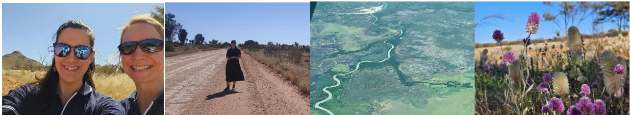
Monash team members Amanda & Meaghan (1) and Emma (2) in Central Australia, views from the plane in Top End (3) and the amazing Central Australian wildflowers out in force (4)!

During July and August, we had 14 amazing data collectors from our partner organisations (as well as 4 members of our research team and one of our PhD students!) hitting the ground in stores all over the NT to collect data for the final Benchmarking assessment. As always, it is a huge achievement to have collected price (Healthy Diets ASAP) and practice (Store Scout) data from all 29 participating stores, as well as price data in regional centre stores over 8 short weeks and across such a vast geographical area. A massive thank you to everyone involved for your awesome work!