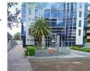
MAPrc, 607 St Kilda Road