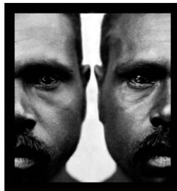
Brook Andrew I split your gaze 1997 Duraclear mounted on acrylic, edition of 10 135.0 x 127.3 x 0.6 cm Courtesy of the artist and Tolarno Galleries, Melbourne