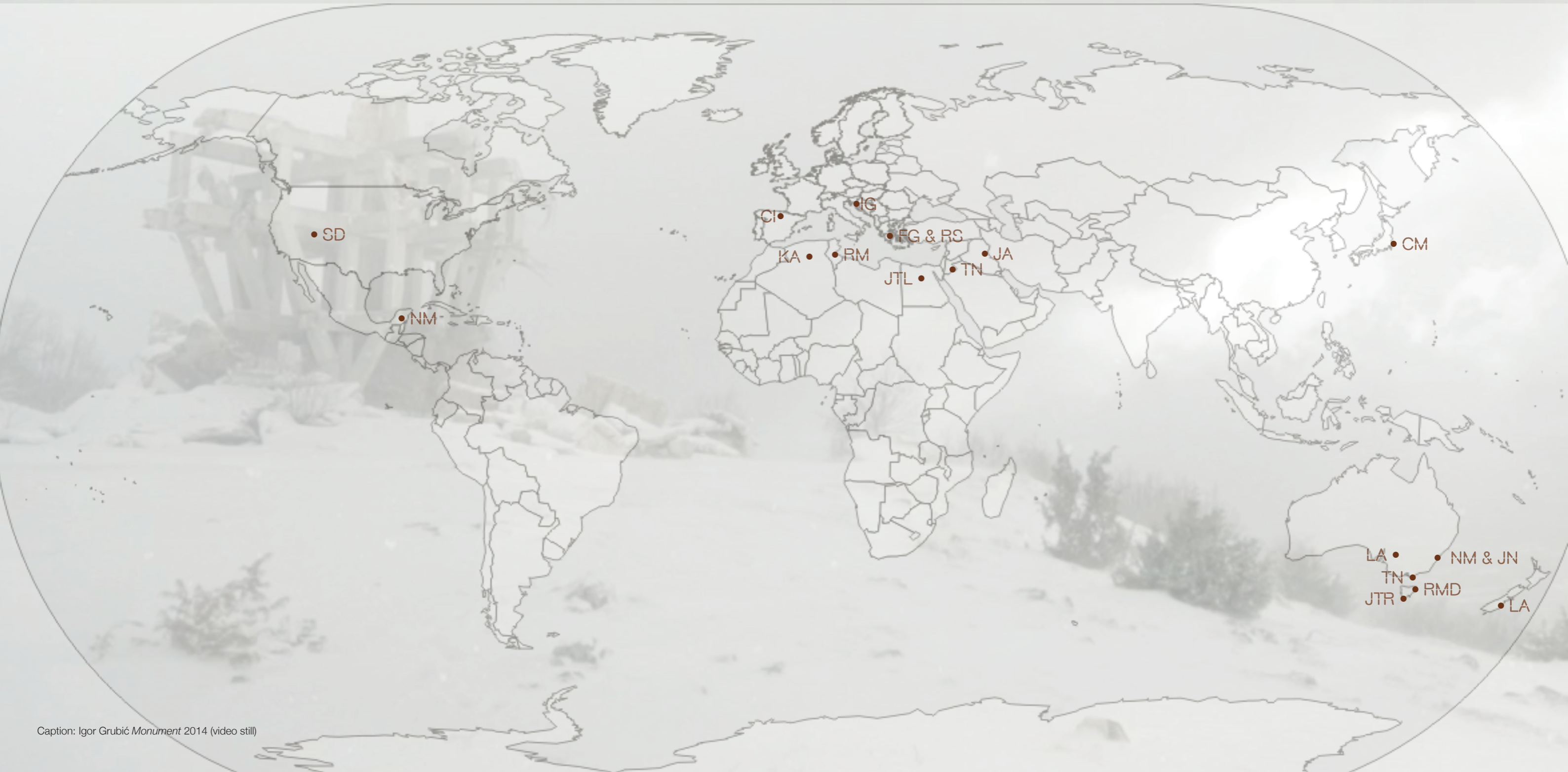
Caption: Igor Grubić Monument 2014 (video still)

JTR James Tylor The Aboriginal dwellings that were once built across south eastern Australia.