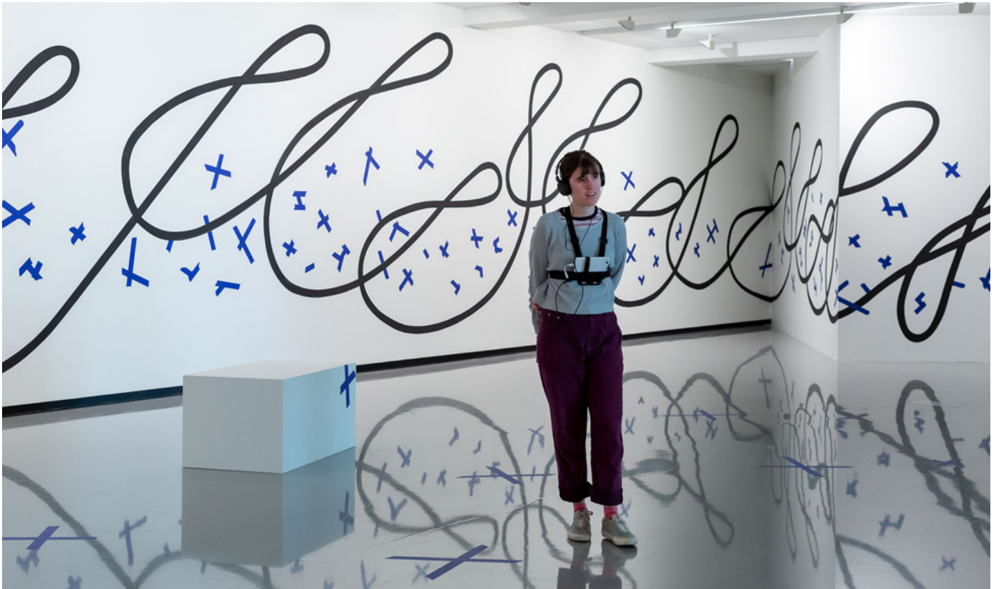
Installation view, Agatha Gothe-Snape: The Outcome Is Certain , Monash University Museum of Art, Melbourne, 2020.